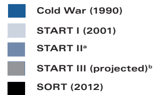
Table 1 U.S. Stockpile Levels 1990-2012

Moreover, the number of warheads in the active arsenal in 2012 will differ little from that planned under START II reached with Russia and the proposed START III. In setting a framework for START III negotiations, Clinton and Yeltsin set a goal of each country possessing no more than 2,500 accountable strategic warheads. The START III proposal also included important guidelines on transparency and verifications and other arms control restrictions that were not included in SORT. The Bush administration has ridiculed the complexity of those treaties and the time it took to achieve them. Yet, the crucial number of weapons in the active arse-